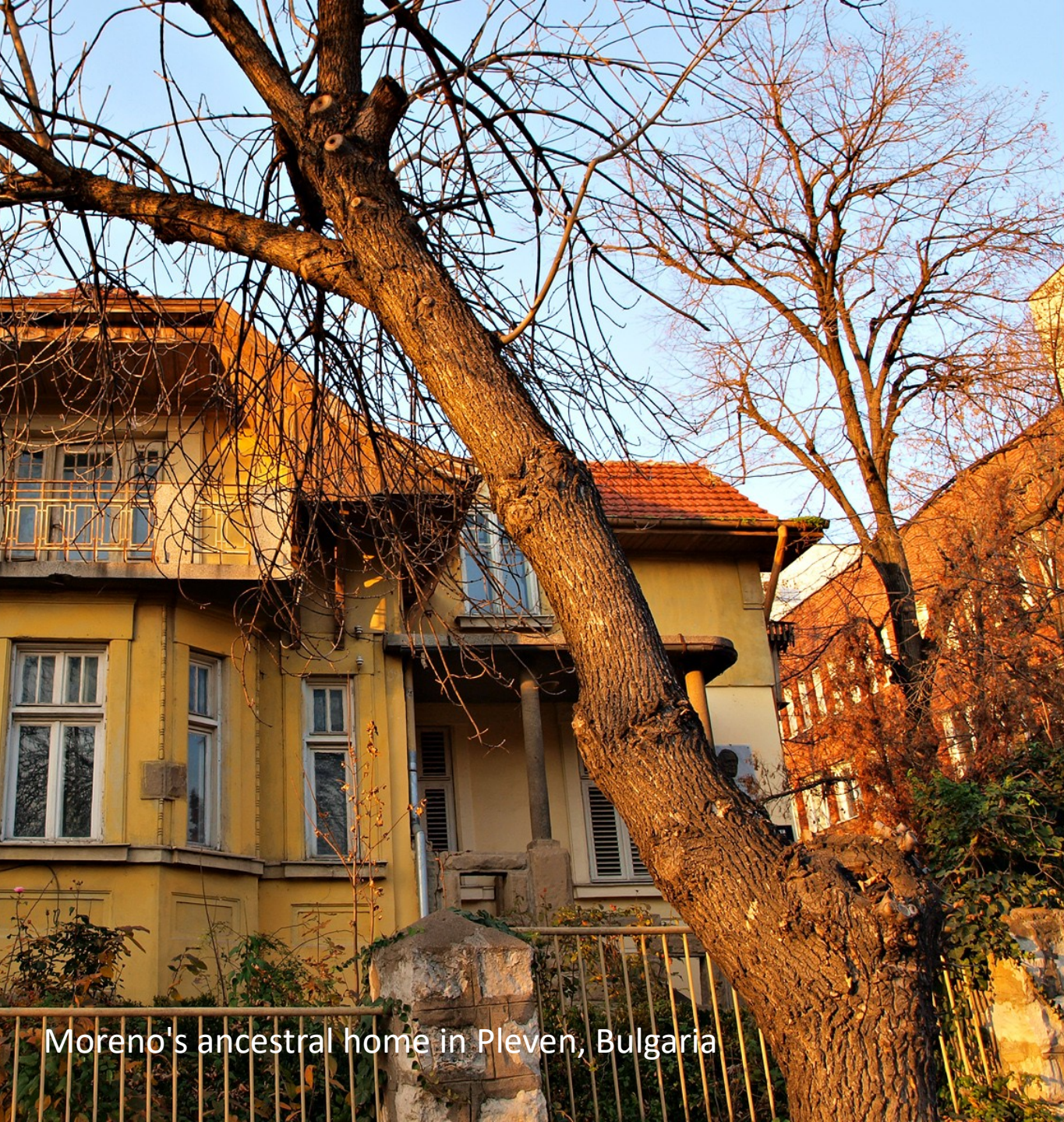
Moreno's ancestral home in Plevna, Bulgaria