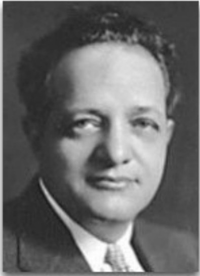
J.L. Moreno 1889-1974 Romanian, Austrian, American Psychiatrist.

“I attended one of Freud’s lectures. He had just finished an analysis of a telepathic dream. As the students filed out, he singled me out from the crowd and asked me what I was doing. I responded, ‘Well, Dr. Freud, I start where you leave off. You meet people in the artificial setting of your office. I meet them on the street and in their homes, in their natural surroundings. You analyze their dreams. I give them the courage to dream again. You analyze and tear them apart. I let them act out their conflicting roles and help them to put the parts back together again.’”